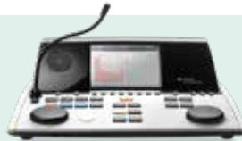
AD629 Diagnostic audiometer