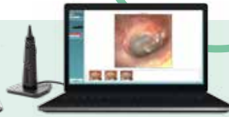
Viot™ Video otoscope