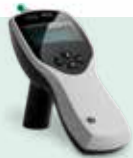
MT10 Handheld tympanometer