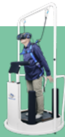
Dynamic force plate