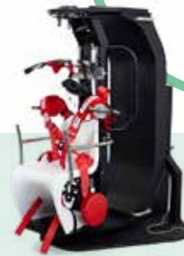
TRV Chair Diagnosing and treating Benign Paroxysmal Positional Vertigo (BPPV)