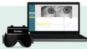
VisualEyes™ 525 Complete VNG solution for balance assessment