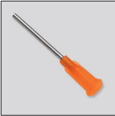
Part# 8514319 Vacuum Tip #15 Gauge with Safety Lock Attachment .059" x 1"

Single use for the UltraVac+ tips ensure the highest level of sanitation. Cross contamination is eliminated with single use. To ensure proper seal MedRx supplied tips are recommended.