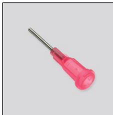
Part# 8514322 Vacuum Tip #18 Gauge with Safety Lock Attachment .038" x 1/2"