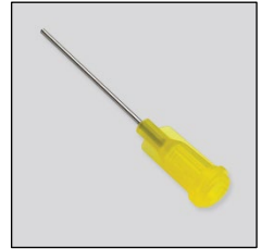
Part# 8514325 Vacuum Tip #20 Gauge with Safety Lock Attachment .025" x 1"