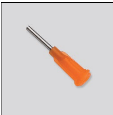
Part# 8514320 Vacuum Tip #15 Gauge with Safety Lock Attachment .059" x 1/2"