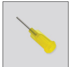
Part# 8514324 Vacuum Tip #20 Gauge with Safety Lock Attachment .025" x 1/2"