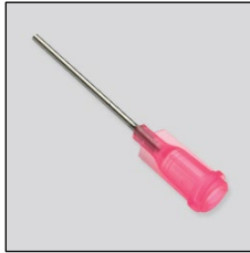
Part# 8514321 Vacuum Tip #18 Gauge with Safety Lock Attachment .038" x 1"