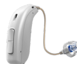
Oticon CROS miniRITE T