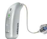
Oticon CROS PX miniRITE R

Oticon More 1* : miniRITE R, miniRITE T, miniBTE R, miniBTE T