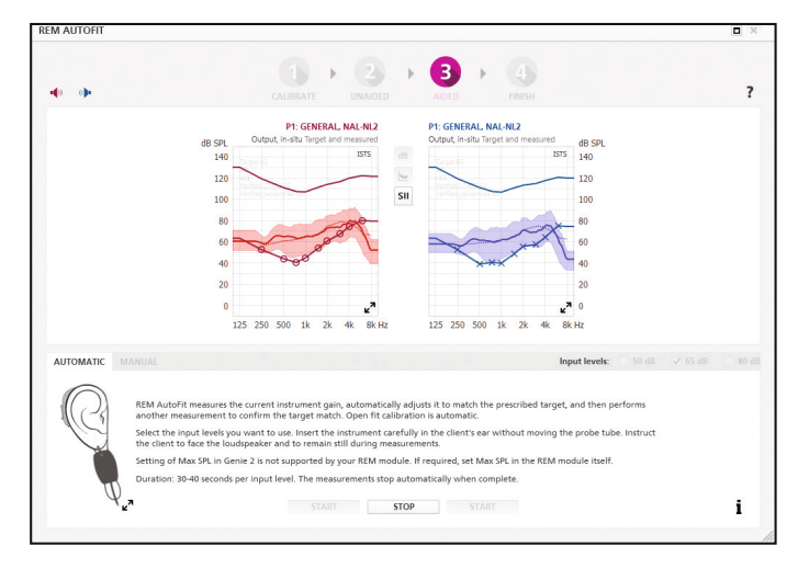
Speech mapping on Step 3: Aided (Automatic)