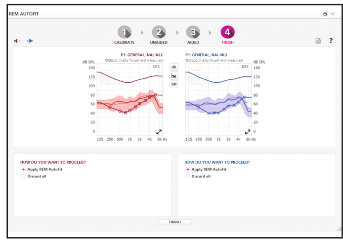
Speech mapping on Step 4: Finish