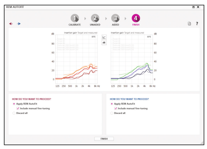
Insertion gain on Step 4: Finish

Select Discard All to discard REM AutoFit adjustments. The data in use before you entered REM AutoFit is then restored.