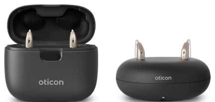
Oticon SmartCharger Oticon Desktop charger