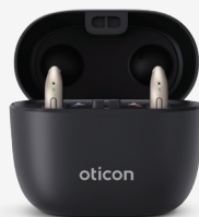
Oticon Intent SmartCharger