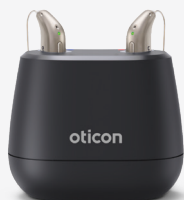
Oticon Intent Desktop charger